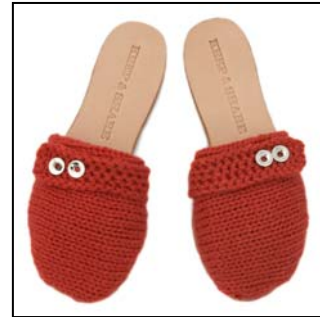
Keep and Share